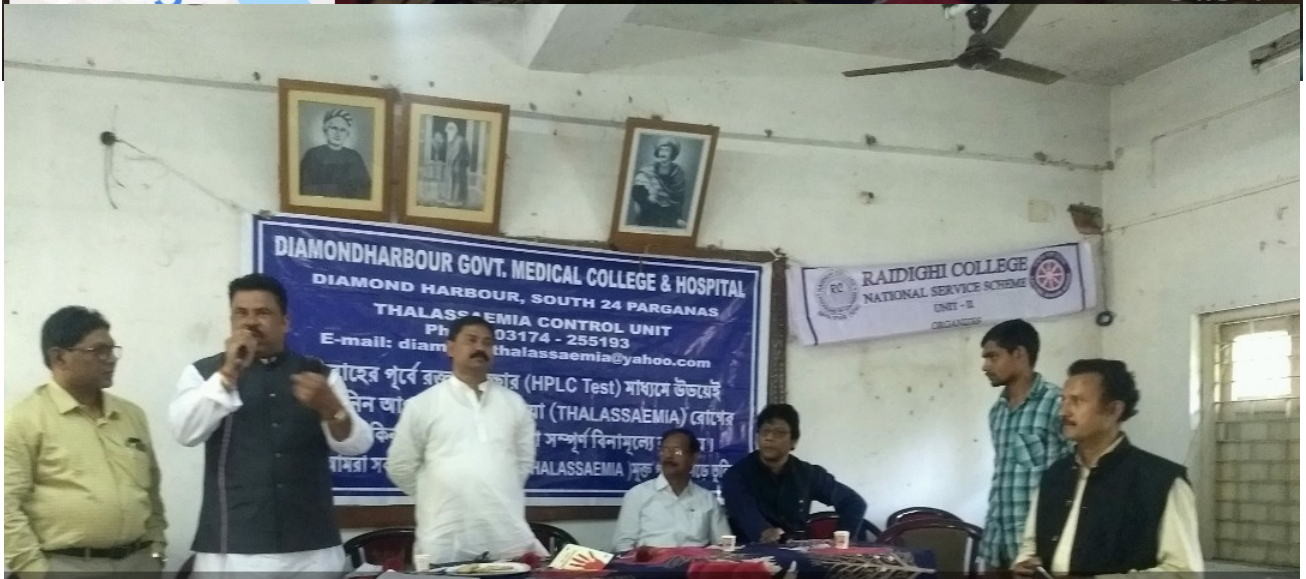
Raidighi - Boler Bazar Rd, Raidighi, West Bengal 743349, India