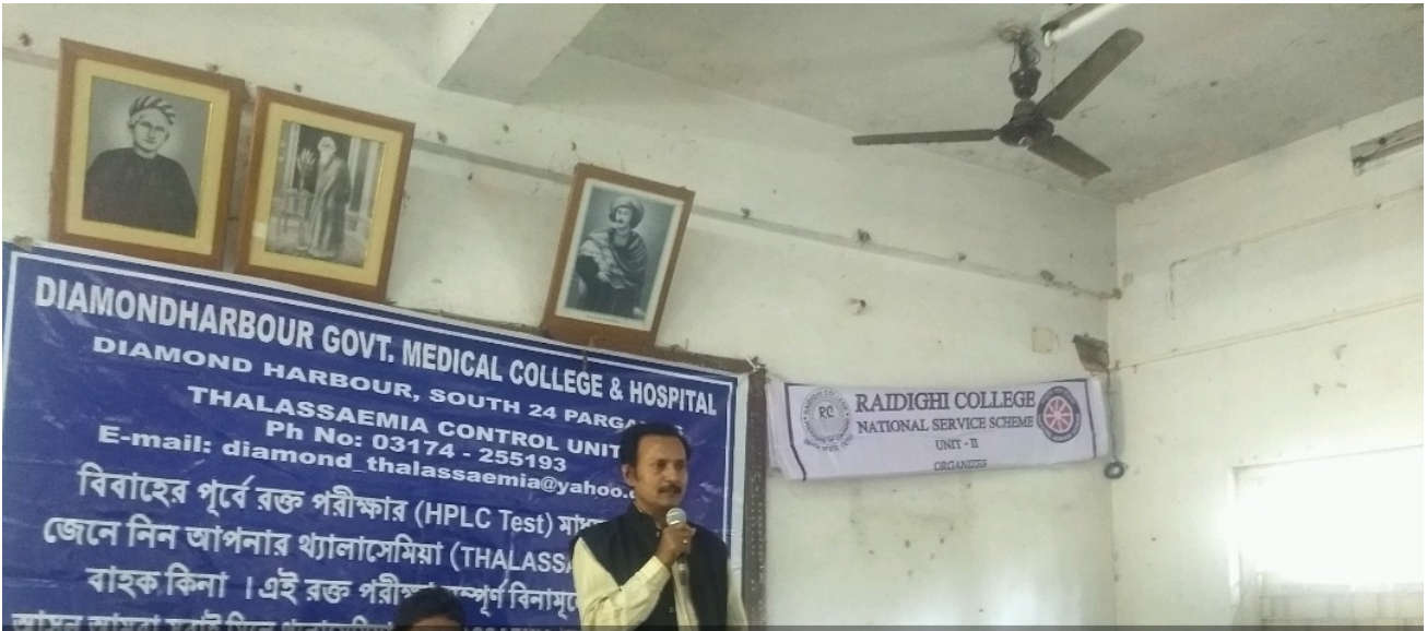
Raidighi, 1 no ward, Raidighi, West Bengal 743383, India