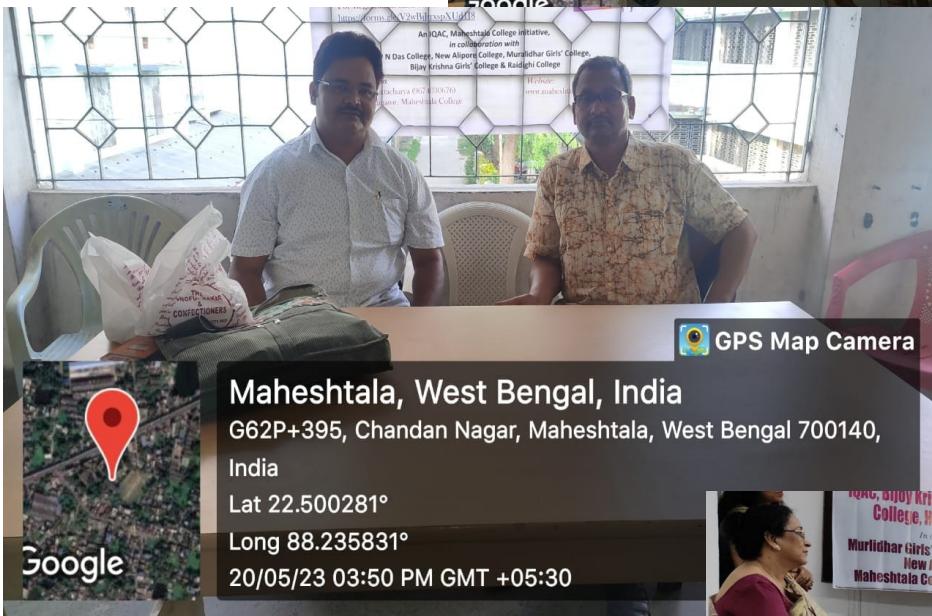
Maheshtala, West Bengal, India G62P+395, Chandan Nagar, Maheshtala, West Bengal 700140, India Lat 22.500281° Long 88.235831° 20/05/23 03:50 PM GMT +05:30