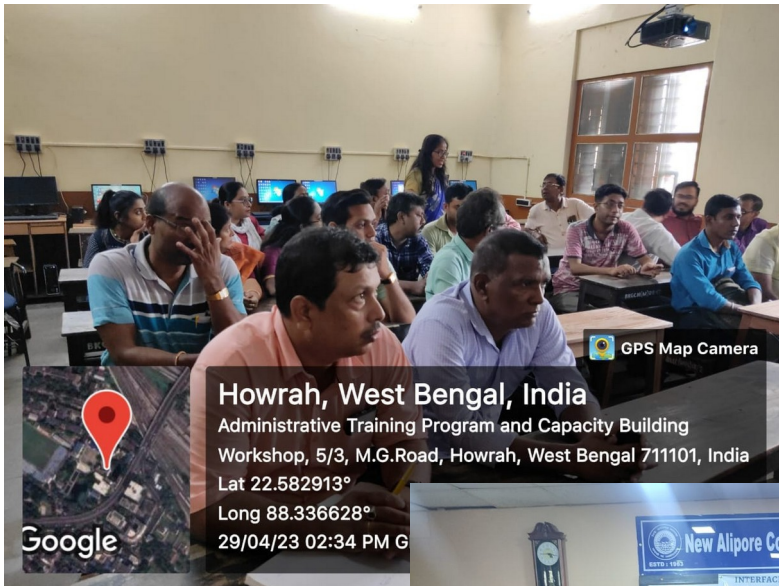
Howrah, West Bengal, India Administrative Training Program and Capacity Building Workshop, 5/3, M.G.Road, Howrah, West Bengal 711101, India Lat 22.582913° Long 88.336628° 29/04/23 02:34 PM G